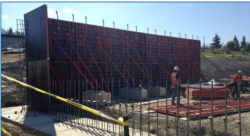
Formwork for east wall of the building