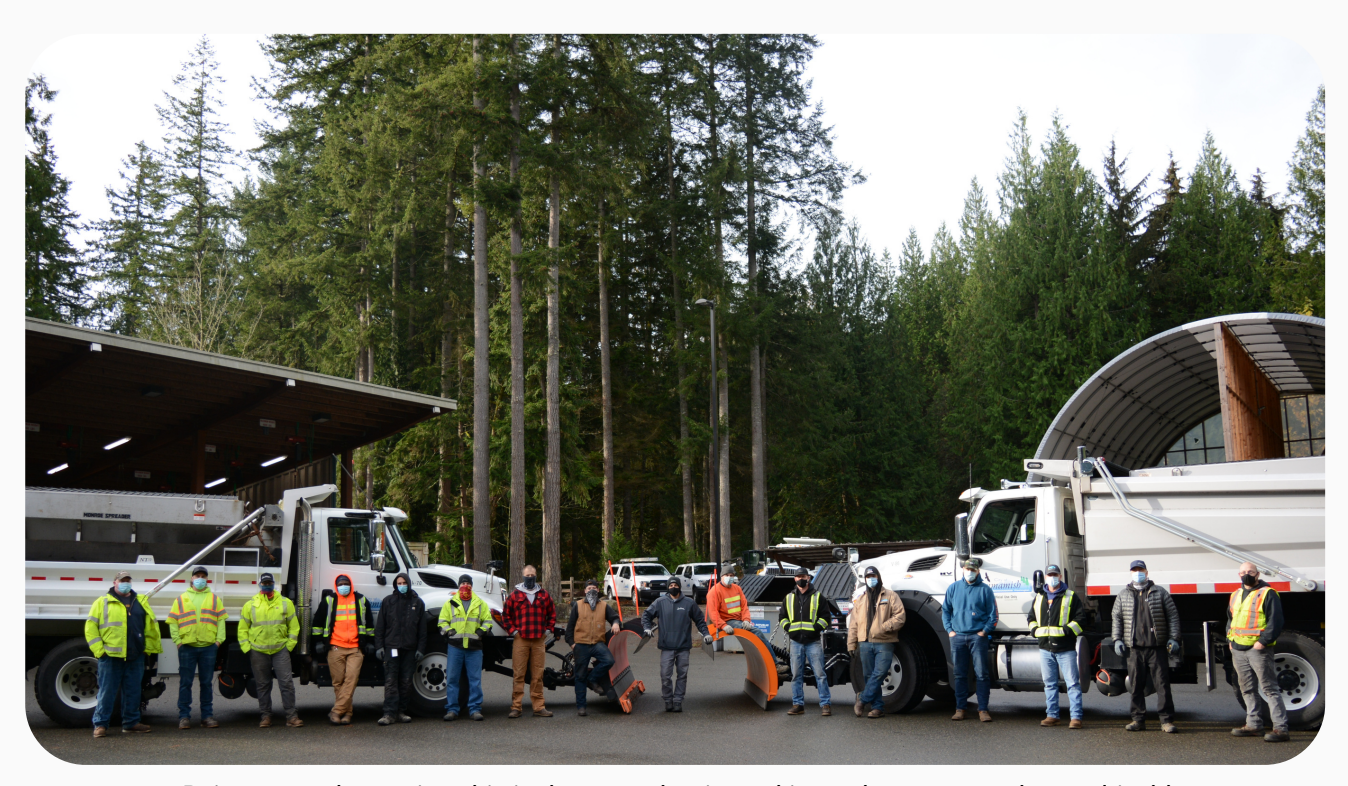
Rain, snow, sleet or ice, this is the team that is working to keep our roadways drivable.

This is the teams first "snow and ice" meeting of the season. Getting trucks, plows and sanders ready for whatever the weather gives us. This year, the team has adjusted to COVID-19 precautions, requiring the crew to work solo or in small teams. They also thoroughly sanitize vehicles at the end of each shift.