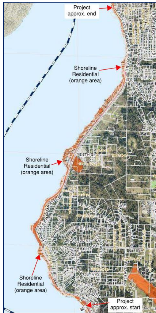
Figure 3 Shoreline Designation